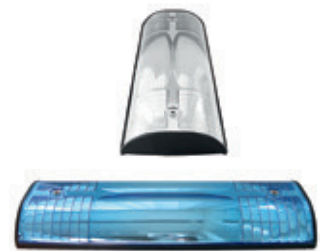
Wild animal reflector light-blue and silver-white